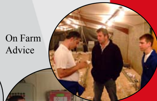
On Farm Advice