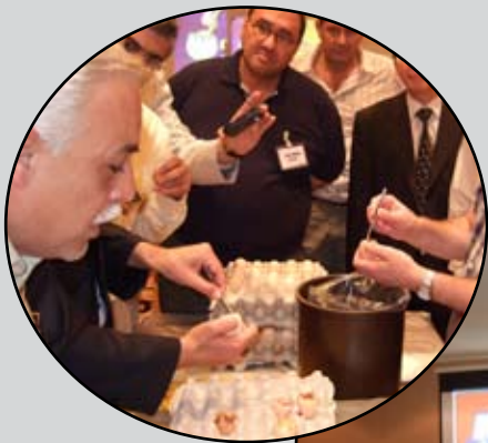
Workshops & Seminars

Part of Arbor Acres' commitment to customer service is the provision of education and knowledge transfer. This is done in a number of different ways: Training courses, technical literature, customer seminars and roadshows, workshops, laboratory and production training and collaboration with universities and colleges all play a part in this process.